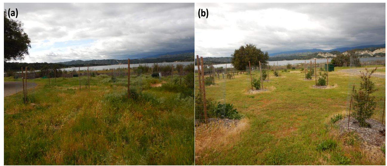
Exhibit 1: Lake Cachuma Oak Tree Restoration Program trees at Mohawk flat showing spring weed growth (a) before and (b) after weeding.